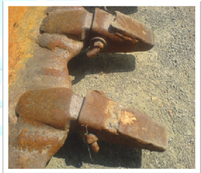
Fig.1 A typical tooth failure

Excavators can come in a huge variety of sizes and shapes. One can purchase or rent that are called mini excavators as well as ones that are referred to as compact excavators. They can be very small and have a big pretty bucket size to still get the work done, that you need. Sometime one can get models that the bucket can be replaced with other objects. Most of the time, excavators are used with loaders and bulldozers to get the most of the job done. Many of the excavators have tracks, but one gets them with wheel preferably.