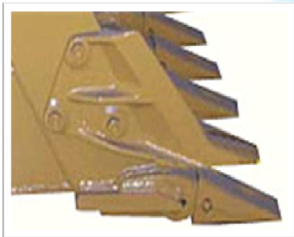
Fig.2 Wedge Shaped Tooth

After doing such operation, there is possibility of breaking of pin in tooth adapter assembly as well as the bending of tooth point. So to calculate the probable failure, the wedge shaped tooth has considered as shown in figure for this work.